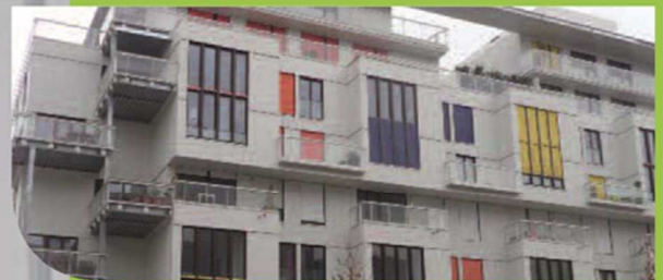
CONNESTABLE – Architect : Viguiet.

Thanks to its beautiful neutrality and its aesthetic coherence, it gives to the project an obvious personality while still meeting more conventional architectural trends.